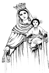
Our Lady of Mount Carmel